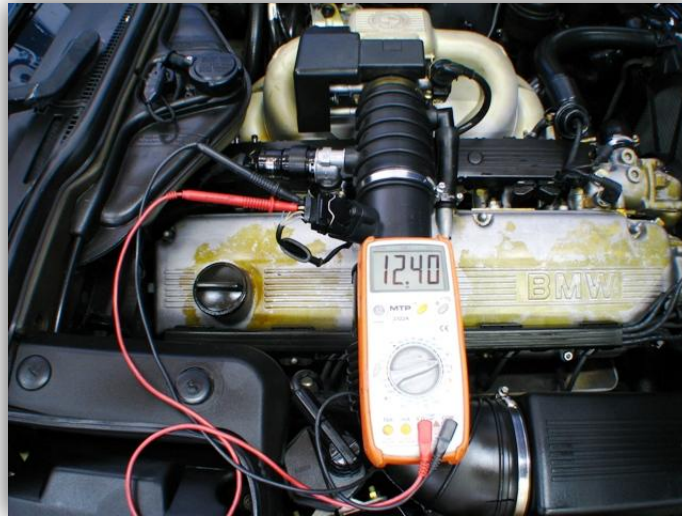
Figure 3 - Checking for 12v

Using your multi-meter set the device to measure at least 12V. Insert the black probe into the back of pin 4, and the red probe into the back of pin 3.