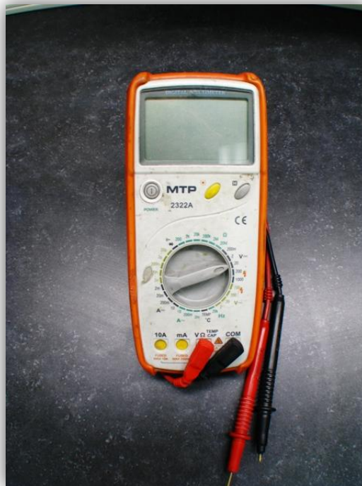
Figure 1 – Multi-meter

All you really need to troubleshoot your MAF conversion is a multi-meter.