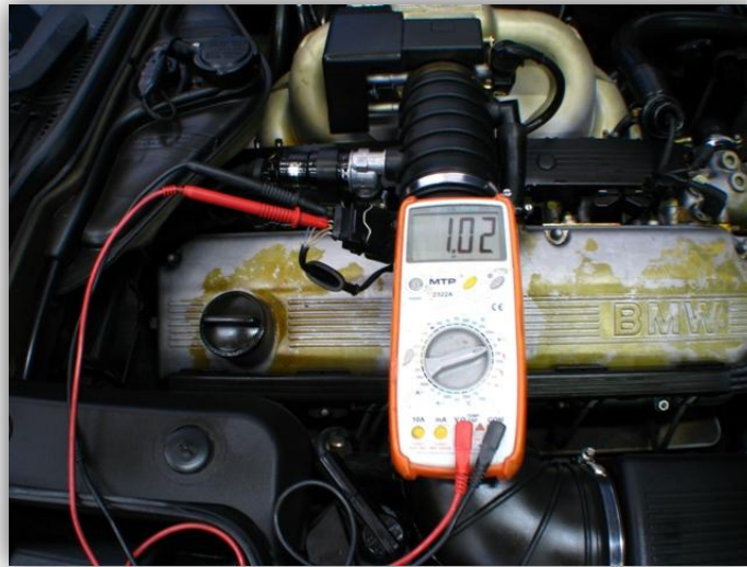
Figure 4 - Checking for Air Flow signal

If you see anything other than the above, please contact us.