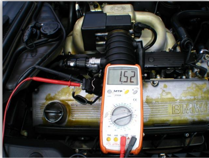
Figure 5 - Checking Air Flow voltage at idle

If your voltage is off by a little that is fine, but if it is a lot higher or lower please calls us.